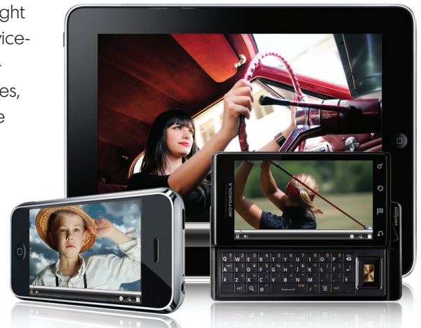
Limelight Video Platform provides high-quality delivery to every device in your mobile strategy.

Scalable hosting and delivery. Reap the benefits of cloud computing over a world-class infrastructure. You can scale as demand for your content increases—and continue to deliver a high-quality experience of your video. Every time.