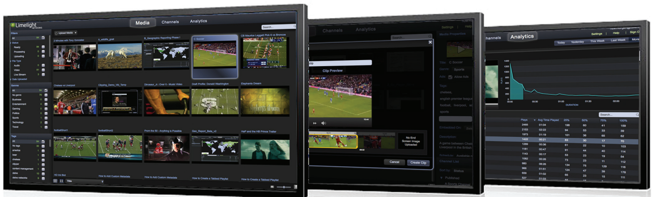
Limelight Video Platform is an end-to-end solution with all the tools you need to publish video on the Internet.

Gain important information about viewer engagement and video popularity with detailed reports. You can graph data for single videos, single channels, or across multiple videos and channels. We also provide tools for integrating with your existing analytics engine, such as Google Analytics, Nielsen, and Omniture.